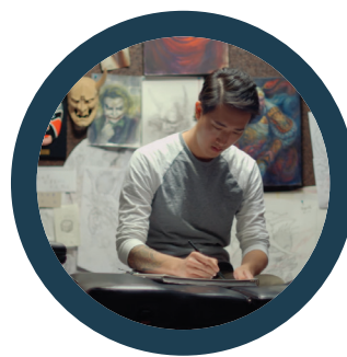
PODCAST & TRAINING VIDEOS